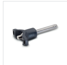
ROSTFREI Inox Stainless Steel