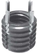
Heavy Duty – Steel

BODY: 1215 STEEL, BLACK OXIDE FINISH. KEYS: 302 STAINLESS STEEL