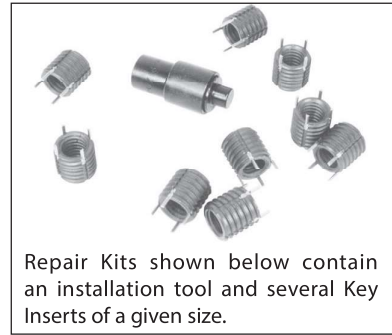
Repair Kits shown below contain an installation tool and several Key Inserts of a given size.

General-purpose threaded inserts suitable for most applications. Available in USA ID-thread sizes from #10-24 to 1-1/2"-12, plus metric sizes from M5 to M24. Important: Use tap drill specified in table (slightly larger than standard for that thread size).