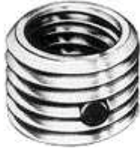
Re-Nu Thread™ Inserts are left soft to allow altering.

We recommend a 90 degree countersink 1/32" larger than the major diameter of the mating thread to prevent damaging the element.