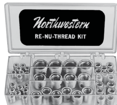
Packaged in a convenient, sturdy, styrene box for use in home, shop or field.